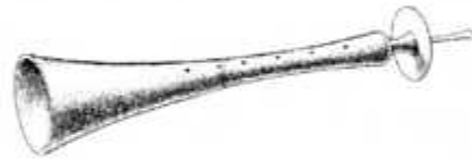
above: a shawm